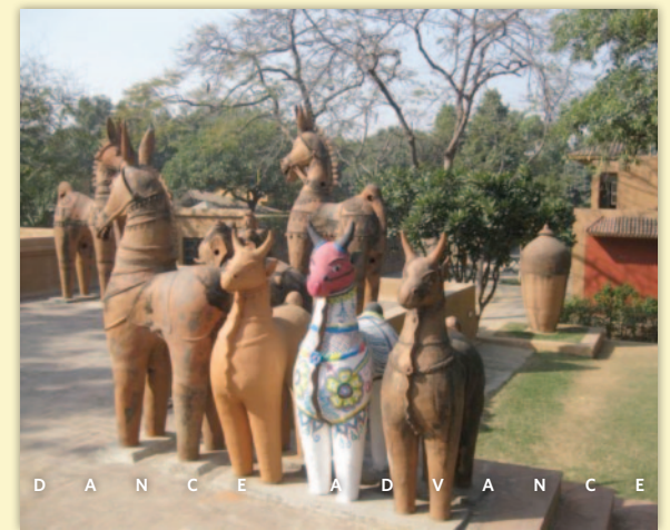
The outdoor terracotta museum at Sanskriti.

Our home base in India is the artist's retreat of Sanskriti: a peaceful oasis of blue sky, green expanses of close-clipped lawns, terracotta sculptures glowing earthily under the pour of sun. A far cry from the car-horn-polluted chaos I have come to associate with urban India, we stay in spartan, stylish little bungalows and wake to the rhythmic sounds of sweeping. Our temporary artistic community here includes a textile specialist, an American and a British visual artist, and an Indian poet, also in residence. Sanskriti's grounds are dotted with architectural arches arcing over lily ponds, groves of champas and banyan trees, textile and terracotta museums, and modest fields of brinjal and okra which yield produce to be cooked for the daily vegetarian meals. Everywhere the modern coexists with the seemingly old; as you walk through the grounds, traditional and contemporary sculptures weathered by sun and wind seem to address the question: "What is really old and what is really new?" This question threads throughout our residency, touching everything from our learning of Mohiniyattam to the artists' personal reflections on their work.